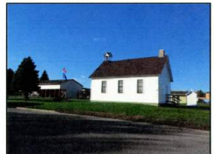
Starbuck School Museum

Thank you to all that have responded to the membership drive!