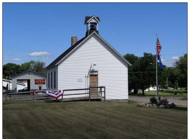
The school bell rope is back in place and the bell rings again. Check the video out at the Depot Facebook page