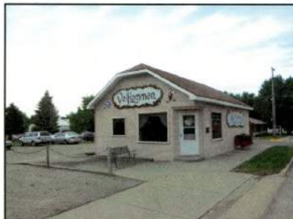
Skoglund / Ness museum