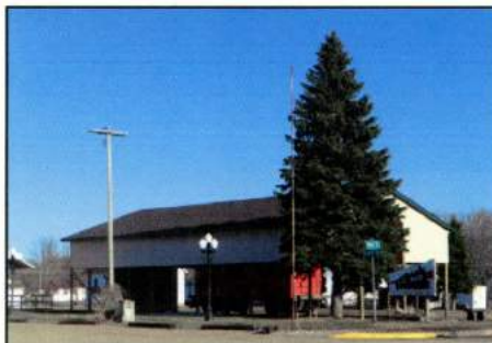
Caboose building and restrooms