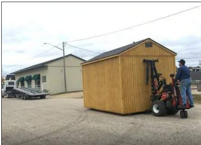
A 10 x 12 building has been added to provide some much needed storage space.